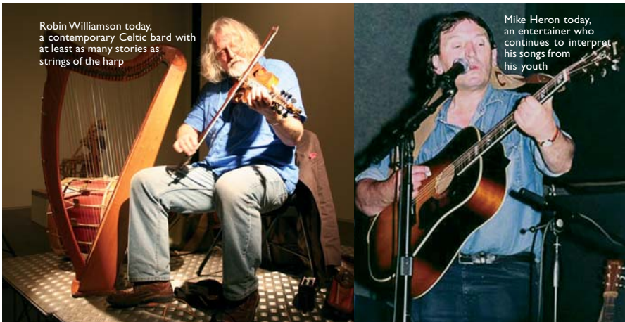
Robin Williamson today, a contemporary Celtic bard with at least as many stories as strings of the harp